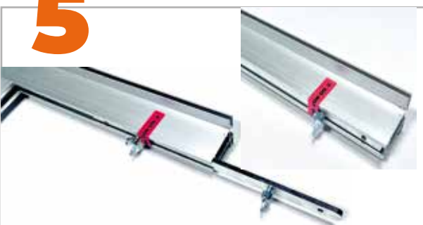
Attach the stickers "do not remove" behind lowest wingnut when strip is exactly inside the frame.