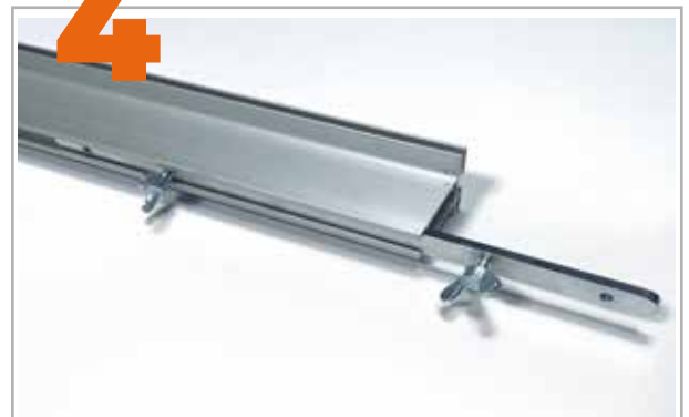
Slide the keder profiles into the frame at the top left and bottom right of the frame.